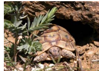
Department of ecology. Miguel Hernández University

The Cartagena-Vera highway crosses the area of the principal populations of the European Spur-thighed Tortoise ( Testudo graeca ) which extends over more than 2,000km 2 between the provinces of Murcia and Almeria. General conclusions have been reached from the programme on corrective measures and environmental observation about the possible long-term effective correction of the impact created by this kind of infrastructure on the Spur-thighed tortoise. The Miguel Hernandez University's Department of Applied Biology